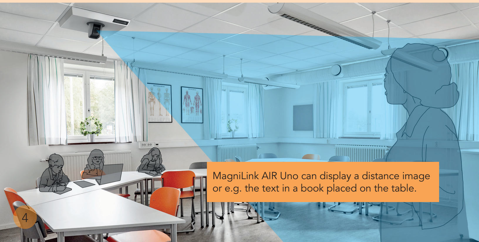
image from the camera is transferred wirelessly to the computer, which provides more work space on the desk, as no surface is occupied by cables. Of course, the fact that the camera is of the latest technology and provides a really sharp image also makes it easier for the user.

MagniLink AIR Uno can display a distance image or e.g. the text in a book placed on the table.