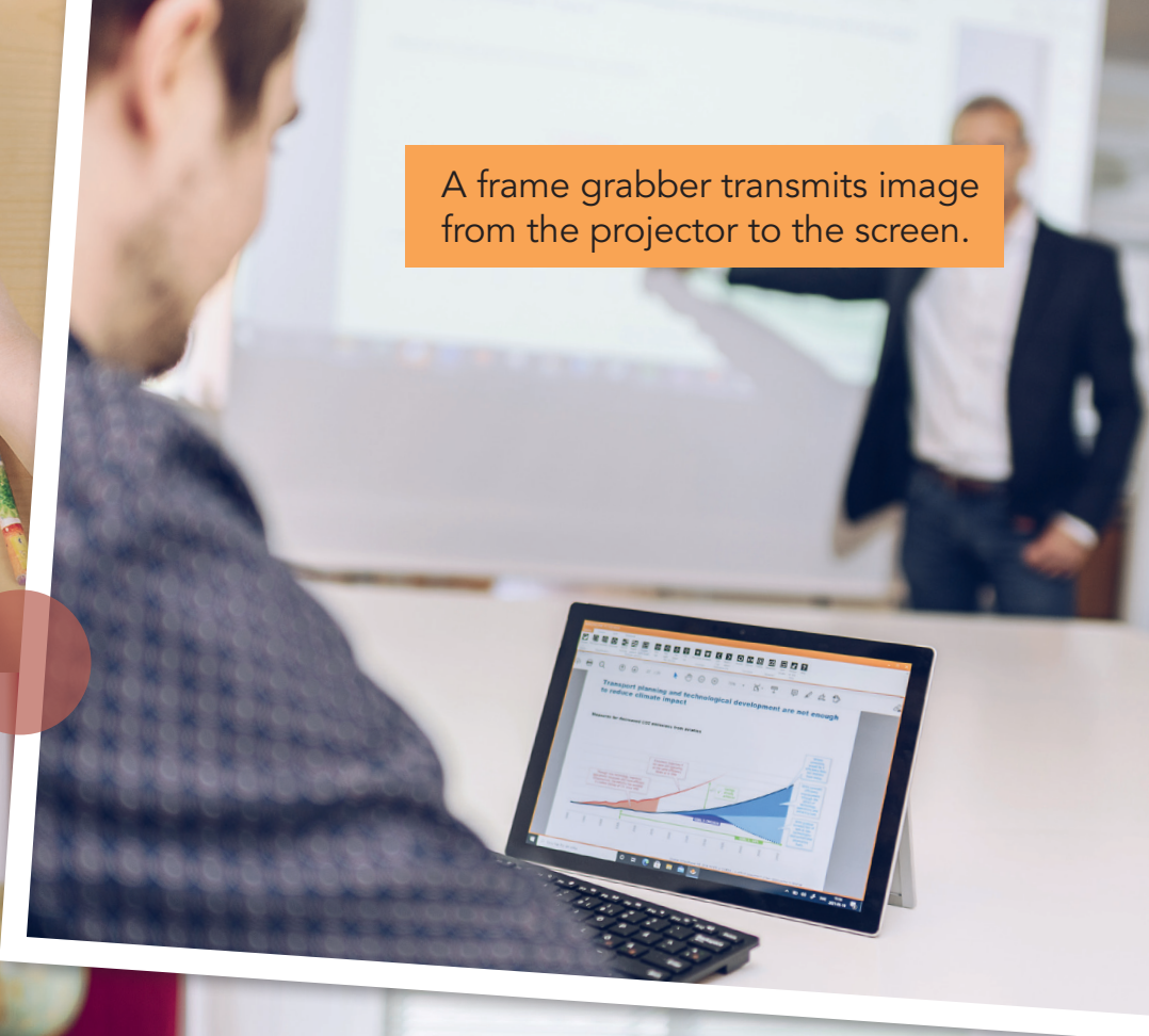
A frame grabber transmits image from the projector to the screen.