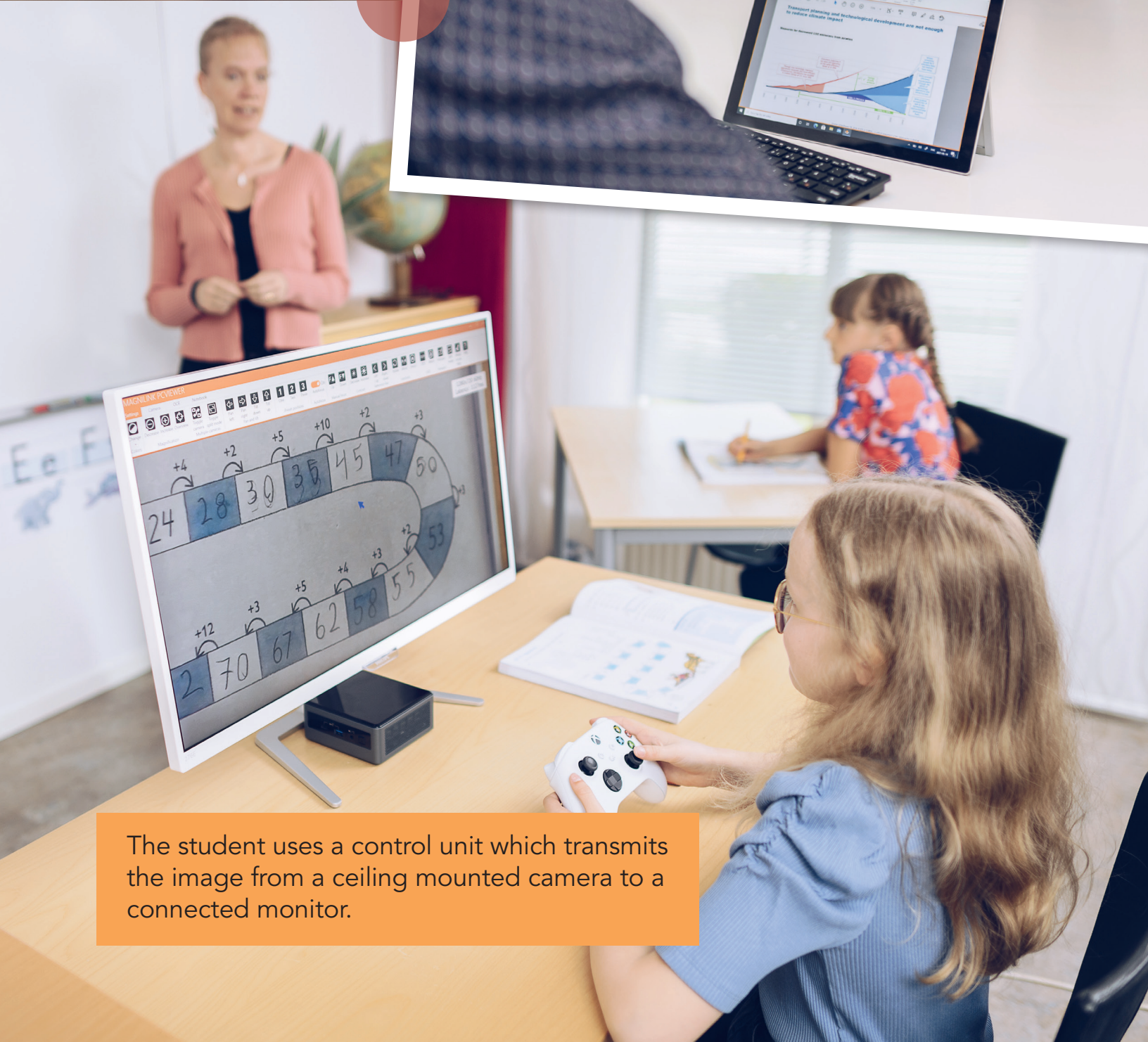
The student uses a control unit which transmits the image from a ceiling mounted camera to a connected monitor.