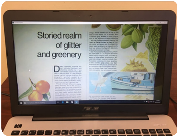
Transformer HD at Lowest Magnification